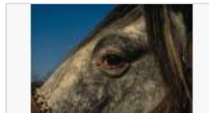
Equine viral arteritis, scrotal edema